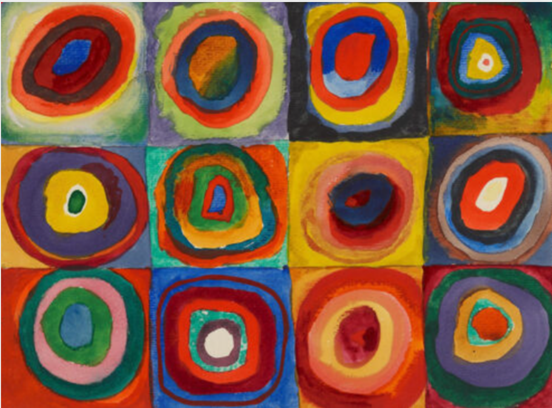
~ WASSILY KANDINSKY ~ SQUARES WITH GEOMETRIC CIRCLES