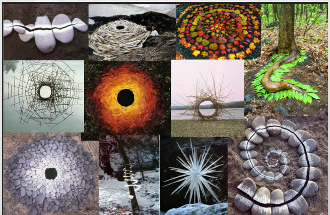
~ ANDY GOLDSWORTHY ~ VARIOUS ARTWORKS